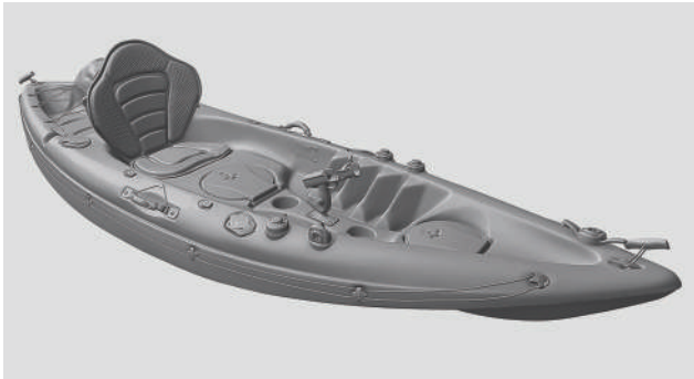
| Turbines, ship propellers, small boats