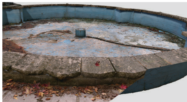
| Crime scenes