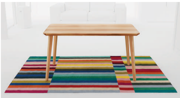
| Furniture and room interiors