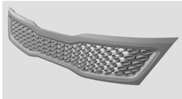
| Automotive parts