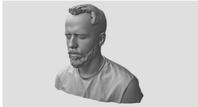
| Statues, and the human body